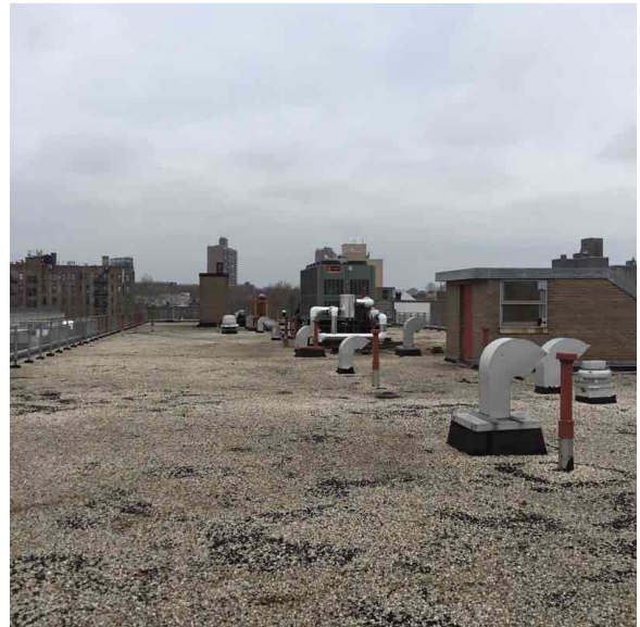
Roof 4 - View

Have any Systems/Major Building Components been upgraded? No Have there been any New Building Additions? No Tandem Schools? Yes Leased Space? No