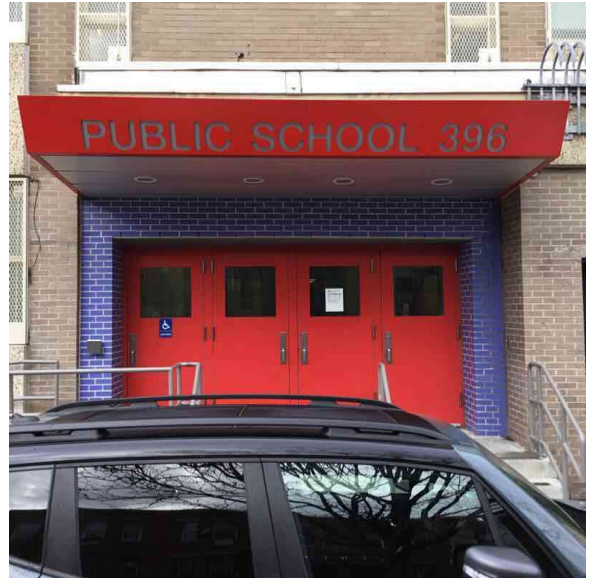
Facade A - Chester Street