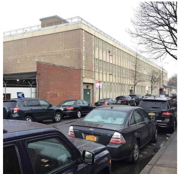
Chester Street - Northwest View