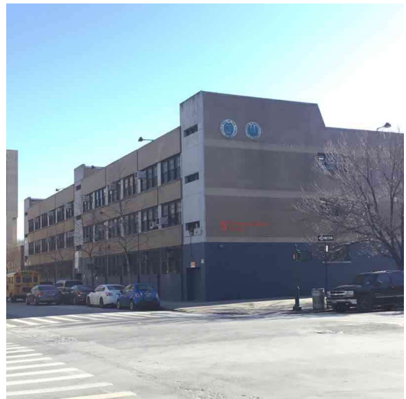
Corner of Lenox Avenue and West 118th Street - South View