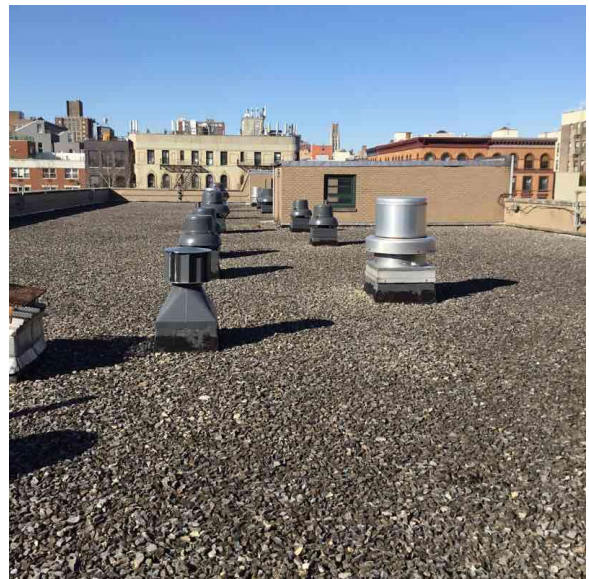
Roof 5 - Northwest View

Have any Systems/Major Building Components been upgraded?