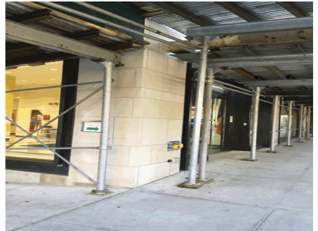
Corner of East 95th Street and Third Avenue