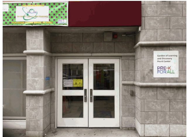
Facade A - Ogden Avenue