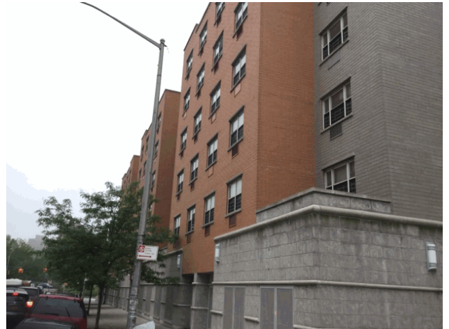
Midblock Ogden Avenue - Northeast View